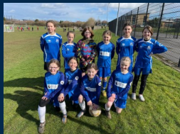
Successful U11 Girls' football team

Take a look at some of our more recent exceptional experiences in school