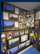
Art exhibited at 'Picture This' at Gulliver's World