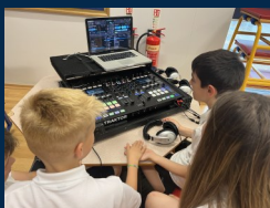
DJing experience in Year 5