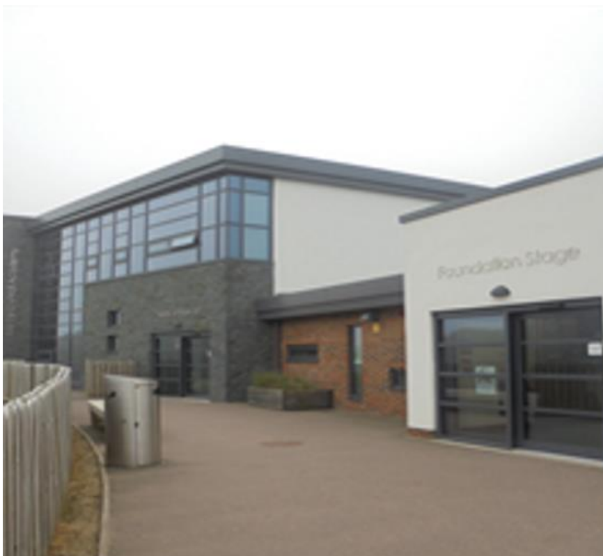
Foundation Stage and Reception Entrances

When you arrive at school you will follow a path passed the Foundation Stage and Reception Entrances leading you onto the Key Stage 1 playground. Your child's classroom (previously Year 1 classroom) is on the right (see picture - right). You will leave your child at the gate and we will be there to greet them and show them inside. There is a one-way system around school. Due to 'safety first' measures which are implemented on site, parents are not yet permitted to enter the school building. Therefore, parents and children will say their goodbyes at the gate outside their classroom.