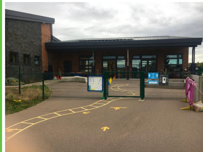
Entrance to your child's classroom

Please enter school via the Lilly Hall Road entrance and exit via the Cliff Hill gate.