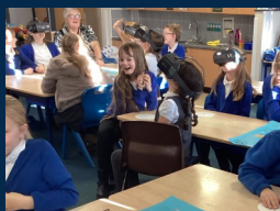
KS2 Virtual reality day

Take a look at some of our more recent exceptional experiences in school