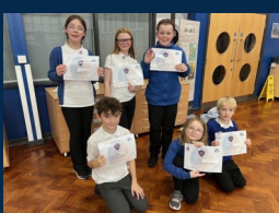
Peer mentor training and awards