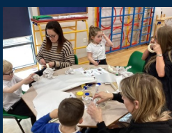
Year 1 creative learning workshop with parents and carers.