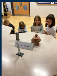
Year 6 Mayan civilisation workshop and artefacts.